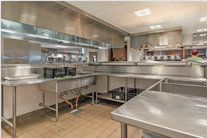
MONTREIGN RESORT CASINO