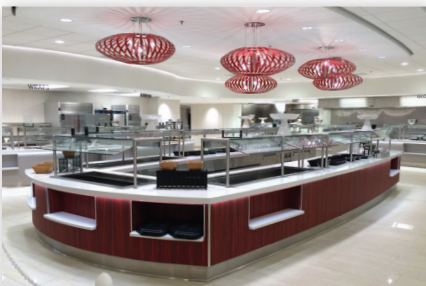
TARGET CORPORATE CAMPUS PROJECT