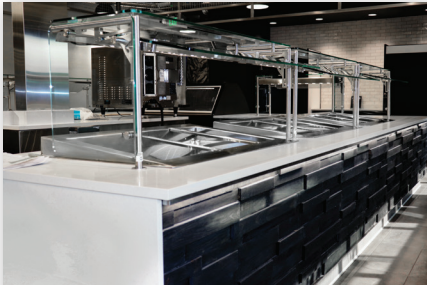
MORTENSON CONSTRUCTION OFFICE BUILDING