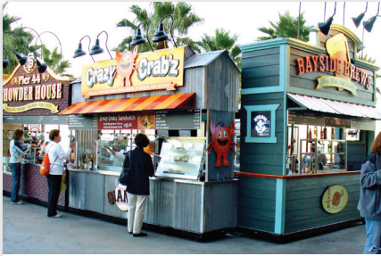
SAN FRANCISCO 49ERS