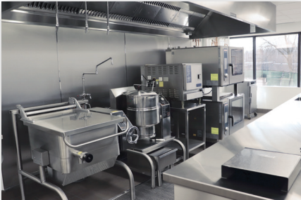
MORTENSON CONSTRUCTION OFFICE BUILDING