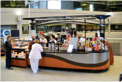
ST. LUKE'S HOSPITAL